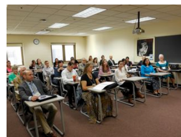
Attendees listen to a presentation