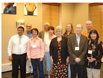
Executive Council members