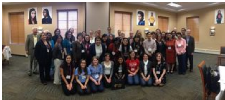
A group photo of attendees after the Farewell Luncheon

https://www.facebook.com/media/set/?set=oa.487252151372227&type=1