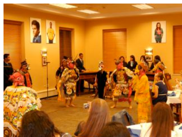
Grupo Marimba Ixchel -Friday Night's dinner entertainment