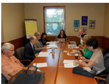
Executive Council meeting