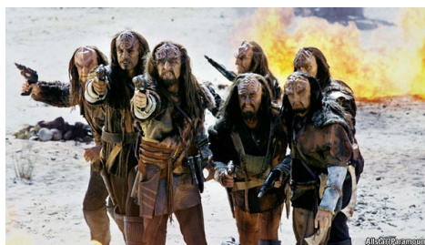
'eSperanto' Hol Dajatlh'a?

The tide of invention shows no sign of abating. David Crystal, an expert on English, receives a proposal for a new language every six months. The neoglossalists' efforts may seem naive, but their belief in the evanescence of English could prove prescient. Mr Crystal reckons that it is only a matter of time before automatic machine translation becomes so sophisticated that the language of Bagehot loses its role as lingua franca. Enjoy it while you can.