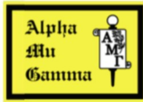
AMG Banner (4 ft x 6 ft) $100.00