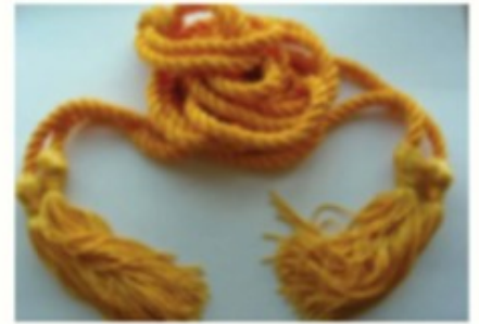
Double Honor Cords (Knotted in middle) $10.00

For more items & order forms, visit: https://www.amgnational.org/store.html