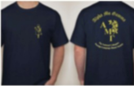
AMG Shirt in Navy (S, M, L, XL) $15.00